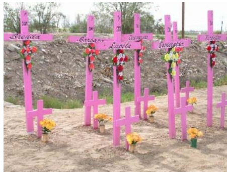
Crosses mark the ditch in Ciudad Juárez where the bodies of 8 women were found in 2001.