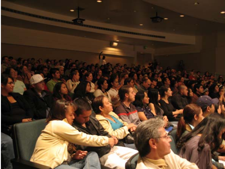
Audience at the Ni Una Más Event at CSUSM on Nov. 22, 2005

They are all our daughters! They are all our loss! We need to act now.