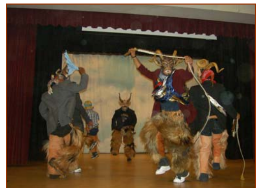
Dance Group "Los Diablos" from San Miguel Tlacotepec performing at OCW

For more information about this and future events, please go to www.csusm.edu/nlrc/events/ or call (760) 750-3500.