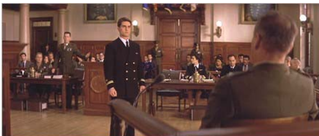
Fig. A

Widescreen films a wider portion of the action so you see more of what's going on to the left and right of the screen (fig A). Full screen is more like a square and emphasizes the action occurring in the center of the screen (Fig B), while cropping off the left and right side. The cameras we have for checkout feature a cinema mode which fakes a widescreen look , but is actually just a standard full screen image with black bars on the top and bottom (fig C). Only use it if you want your films to "look" widescreen.