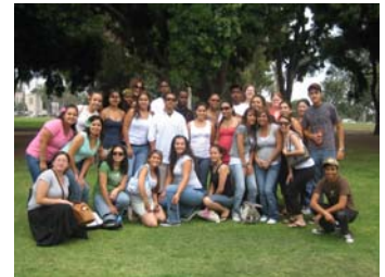
* Summer Bridge Students