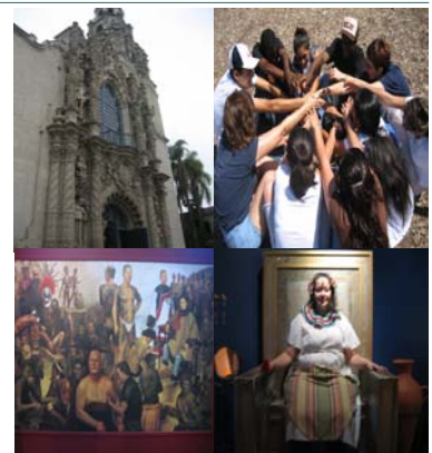
Nearly 40 SSS/DUAL students and staff increased their cultural awareness!

together to enjoy a lunch of Chinese food, followed by a viewing of the exhibition, "Body Ornamentation: Artistic Representations of Self" at the Museum of Man. Afterwards, everyone headed over to The World Beat Center for lessons on African dancing and drumming. Despite the incredibly hot day, many students later stated that this day was the highlight of their entire Summer Bridge experience.